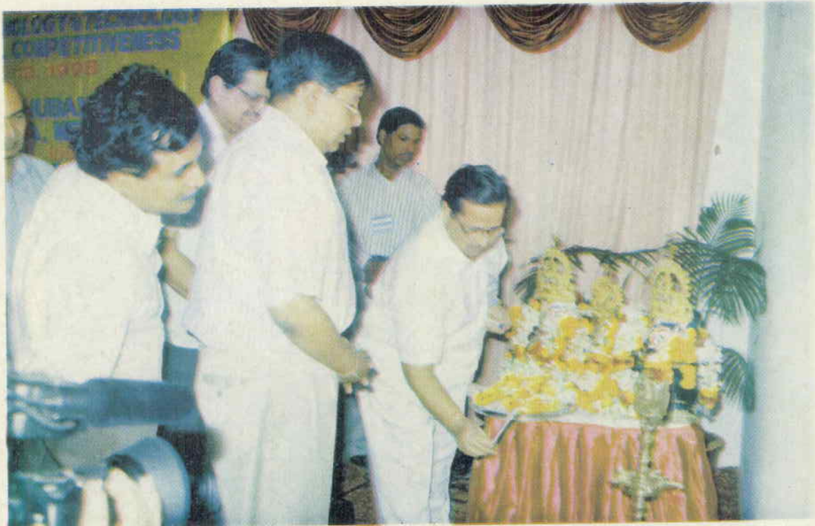
V.A.2 Minister of Industries, Govt. of Orissa inaugurating a Technology Management Programme at Bhubaneswar on Nov. 10, 1998.