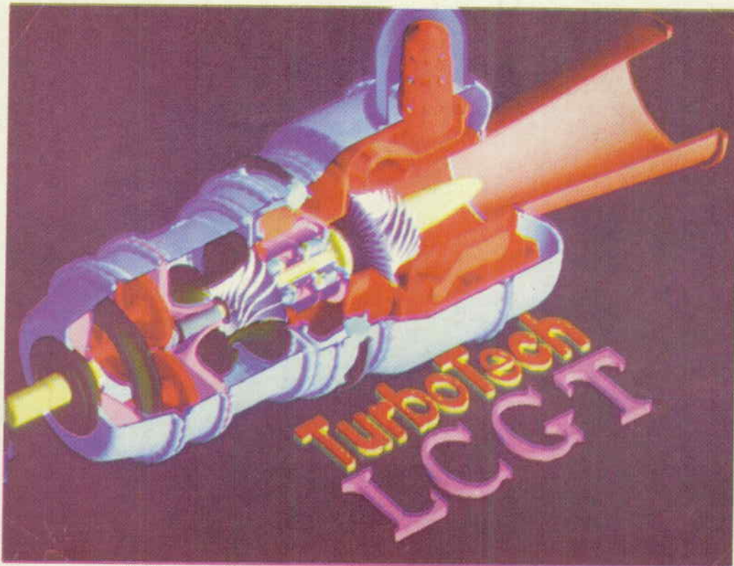
IV.2 Conceptual Drawing of Low Cost Gas Turbine under development at Turbotech Precision Engineering Pvt. Ltd., Bangalore