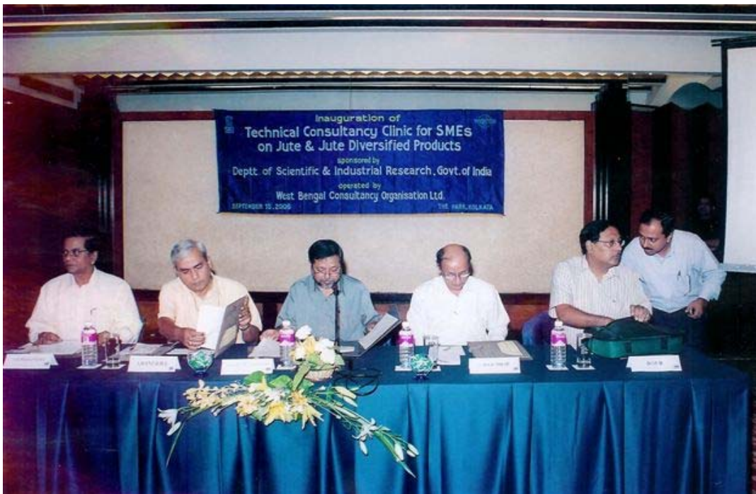
Inaugural Function of the Technical Consultancy Clinic for SMEs on Jute and JDPs Held on September 15, 2006 at The Park, Kolkata.