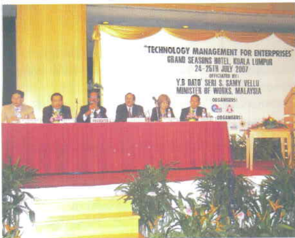
Inaugural Session of the Seminar on "Technology Management for Enterprises" from 24-25 July, 2007 in Kuala Lumpur, Malaysia

Consultancy Development Programme for Asia and The Pacific (TCDPAP). It was supported by Ministry of Works Malaysia, the Construction Industry Development Board Malaysia (CIDB), Ministry of Science, Technology & Innovation (MOSTI), Multi-media Development Corporation Sdn. Bhd. (MDEC), Malaysia External Trade Development Corporation (MATRADE), Small and Medium Industries Development Corporation (SMIDEC), Association of Consulting Engineers Malaysia (ACEM) and Pertubuhan Akitik Malaysia (PAM). This program is one of the initiatives taken by PSDC to enhance the capacity and capability of the Malaysian professional service providers towards export. The programme was sponsored by Technology Management Division of DSIR.