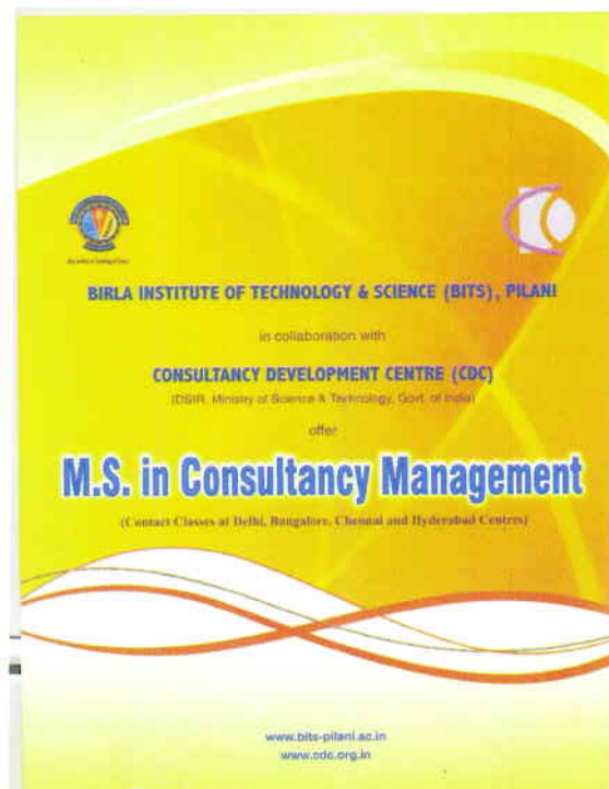
MS Degree Programme in Consultancy Management in collaboration with BITS Pilani

Also, over the years, CDC has developed good faculty in the area and a network of members and professionals across disciplines in different States. Considering that consultancy and