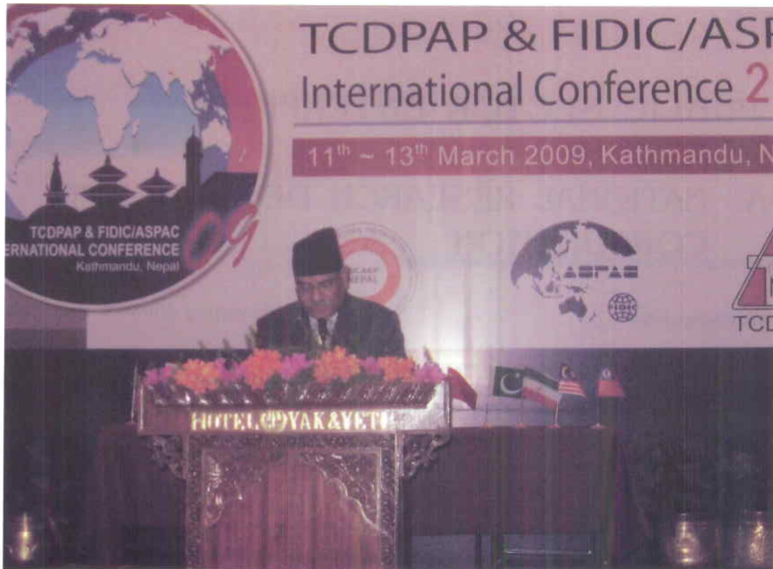
Fig. 48: Delegates of TCDPAP International Conference at Kathmandu