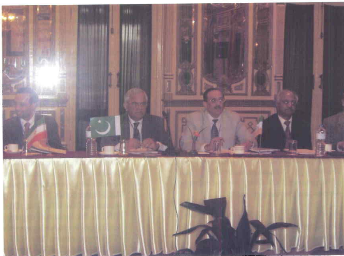
Fig. 47: Mr. Pushpa Kamal Dahal' Prachandra, Prime Minister of Nepal during the Inauguration of the Conference