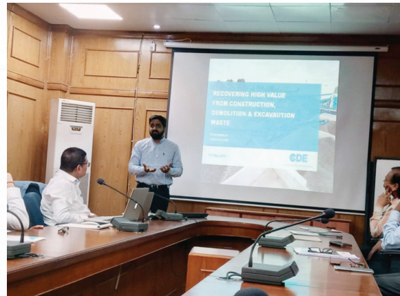
Lecture being delivered by an expert on Harnessing New Sources of Construction Sand through CDE green technology for Environment Protection during Swachhta Pakhwada 2019.