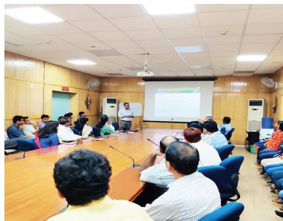
Lecture being delivered by an expert on Menace of Single Use Plastic and its alternatives during SHS 2019.